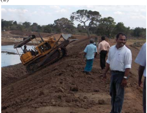
Figure 3. Contour lining for soil water conservation bunds.