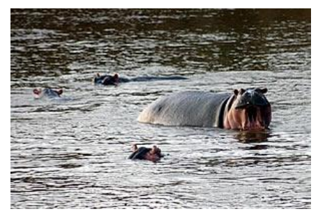
Hippos in the middle section of the Mara River in Serengeti National Park, Tanzania.

The Mara-Serengeti Ecoregion is home to two of the most renowned wildlife conservation areas in Africa - Masai-Mara National Reserve of Kenya and Serengeti National Park Tanzania. These protected areas were established to conserve the annual migration route of more ungulates, than million wildebeest, zebra, including gazelle, and many other species. Animals spend the rainy season (Dec-May) on the verdant Serengeti plains of Tanzania, but when the rains end, a lack of water drives animals 100-200 km northward to Kenya along the Mara River.