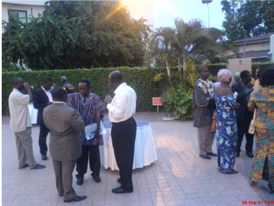
Plate 5: Some participants enjoying themselves during the cocktail session