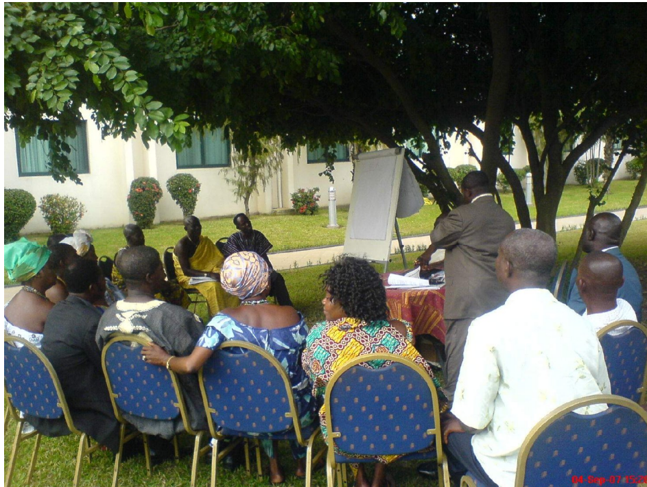
Plate 4: Members of group 4 (Compensation) settled for discussions

To ensure independent work, members settled in their respective groups at different places for commencement of the group discussions. Plate 4 shows settled members of a working group.