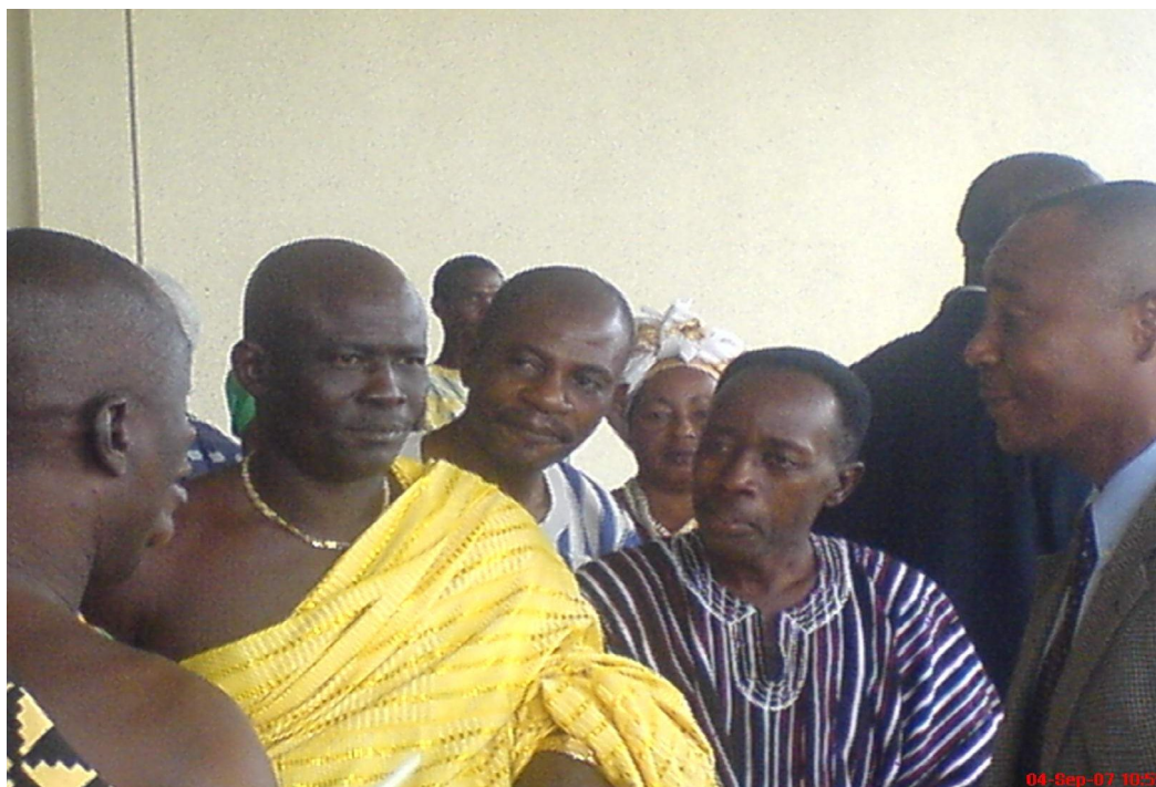
Plate 1: Some participants having discussions at the workshop premises