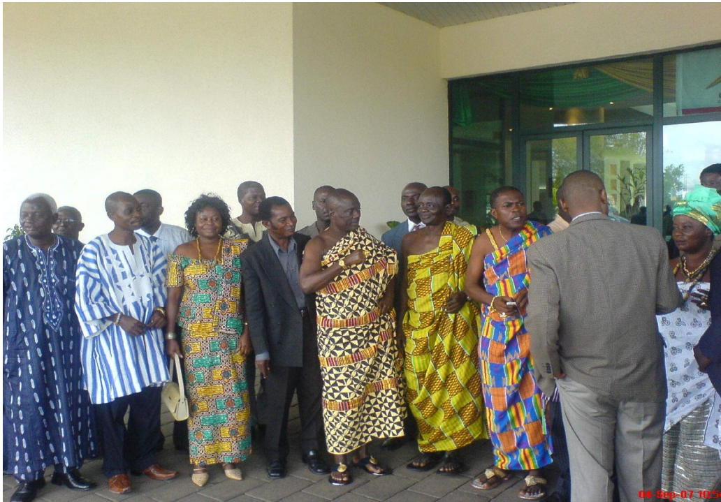
Plate 2: Some participants of the Forum