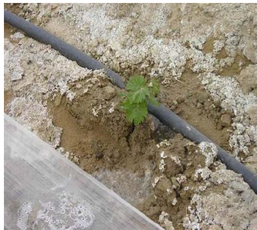
Figure 2. Typical wetting pattern of drip irrigation system

soil surface and root zone of the total field is wetted. Water flowing from the emitter is distributed in the soil by gravity and capillary forces creating the contour lines. The exact shape of the wetted volume and moisture distribution will depend on the soil texture, initial soil moisture, and to some degree, on the rate of water application (figure 2)